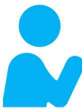
People with underlying medical conditions

Chronic liver disease Cancer Cardiovascular illness etc.